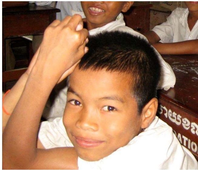
while visiting Siem Reap